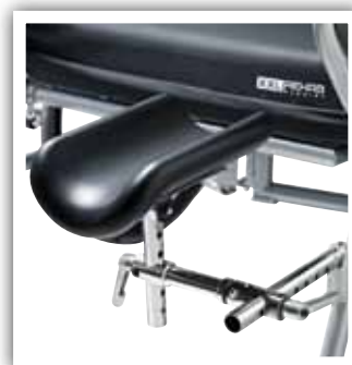
Calf support / amputation support