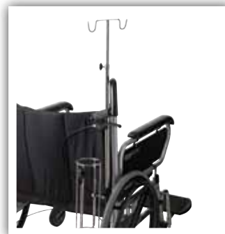
IV holder and O2 holder